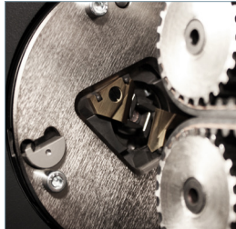
Indexing rotary incision unit and SmartBlade™ system with cartridges and libraries for quick changeover of complete blade sets.