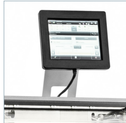
5.7" color touch screen with S.On software for intuitive navigation and library based programming.