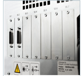
Modularly designed interfaces for full range of accessories, including pre-feeders, marking systems, coilers, stackers and custom devices.